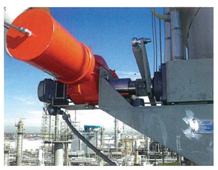
Actuator and controls upgrade to provide better precision to stack damper movements